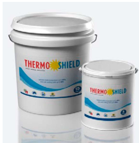
Figure 1a Thermoshield Thermal Insulation

The product contains hollow ceramic beads that create dead air space that acts as insulation as depicted in Figure 1b.